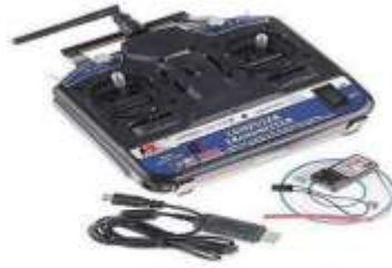
Fig -7: Fly sky CT6B 2.4 6CH Transmitter and FS-R6B Receiver