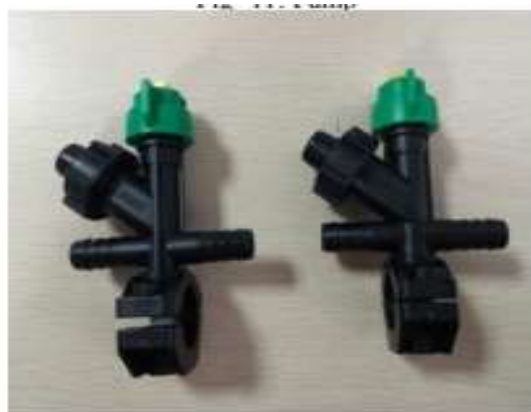
Fig -12: Flat fan Nozzle