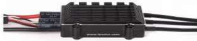
Fig -4: Flame 60A HV