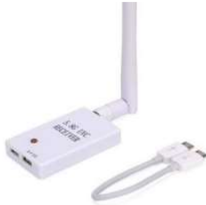
Fig -10: 5.8 UVC OTG Receiver