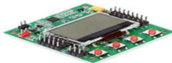
Fig -6: KK 2.1.5 Multi-Rotor LCD Flight controller

The flight controller helps in the manoeuvring operations and also it provides Auto level function. The accelerometer and gyroscope sensors in the Flight controller processes the signals from the receiver and gives the output to the ESC. The KK 2.1.5 Flight controller board can be used in the drone as it has inbuilt firmware. The features of this Flight controller board are much easier for calibration. It uses ATMEL Mega 644PA 8-bit AVR RISC-based microcontroller with 64K of memory