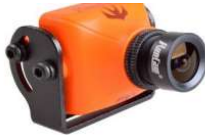
Fig -8: FPV camera

The camera that can be used is HD FPV camera 1200 TVL, it has 2.8mm Lens, auto/colour/black & white Day and night format. TS5828 32CH mini transmitter can be connected to the camera for transmission of video signals to receiver at ground.