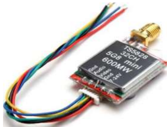
Fig -9: Video Transmitter