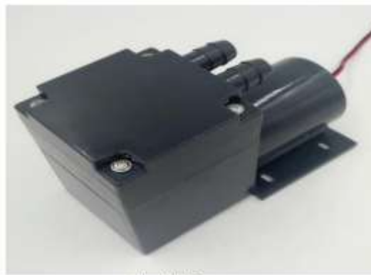
Fig -11: Pump

To pressurize the liquid a 12 V DC water pump can be used which has 2.5 L/min capacity can be used. Then the pressurized liquid enters the nozzle and gets sprayed. The nozzle that can be used is a flat fan type for spraying the liquid. Four nozzles are connected with ducts and they are placed at 45cm distance between each other.