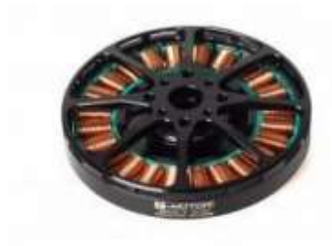
Fig -2: T-MOTOR MN 7005 KV115

Outer runner BLDC motors in which there are no brushes, they have a permanent magnet. The RPM of the motor can be controlled by varying the input current. This motor TMOTOR MN 7005 KV115 and P24x7.2F propeller produces a maximum thrust of 4783 grams