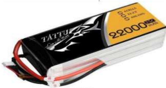
Fig -5: Li-Po battery

The battery that can be used is a Li-Po battery of 22000mAh capacity and 22.2 V. In this battery six Li-Po cells are connected in series ( 6 \times 3.7 = 22.2V ).